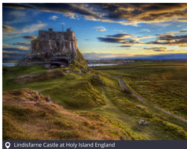
Lindisfarne Castle at Holy Island England

There are two sections in the Plan currently open to new joiners. Both sections are defined contribution pension arrangements. The chart below explains the differences.